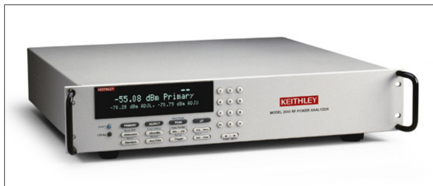
Figure 1. The Keithley Model 2800 RF Power Analyzer is intended for production testing of cell phones and RFIC power amplifiers.

A spectrum analyzer, being a very versatile instrument, is correspondingly laborious to set up. An RF power analyzer, because it is intended for certain specific tests, has the parameters for those tests pre-programmed. It can be set up from the front panel using a menu, or by computer via an IEEE-488 link. It can take just five GPIB commands to measure and transfer five readings—carrier channel power, upper adjacent channel power, lower adjacent channel power, upper alternate channel power, and lower alternate channel power—to the external PC controller. A spectrum analyzer may take from two to eight times as many commands to do the same job.